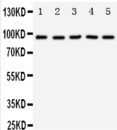
Anti-TrkC antibody, ABO11301, Western blotting Lane 1: Rat Brain Tissue Lysate Lane 2: Mouse Brain Tissue Lysate Lane 3: U87 Cell Lysate Lane 4: SHG Cell Lysate Lane 5: NEURO Cell Lysate