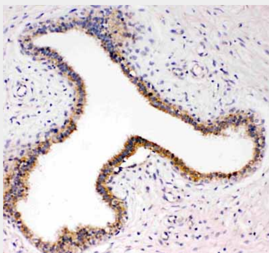
Anti-TrkC antibody, ABO11301, IHC(P) IHC(P): Human Mammary Cancer Tissue